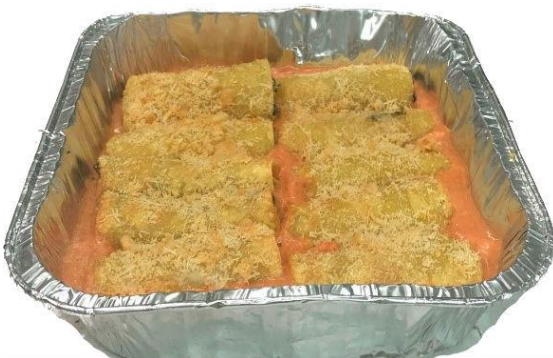
Cannelloni di Ricotta e Spinaci