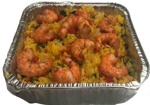
Oven-baked Saffron Rice