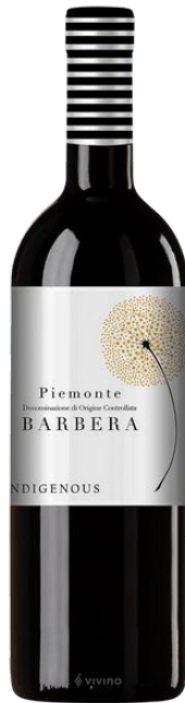
Barbera Dine in $80.00++ Take away $48.00+