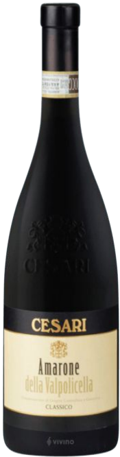
Amarone Classico Dine in $135.00++ Take away $95.00+