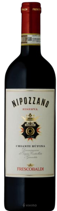
Chianti Rufina Dine in $95.00++ Take away $62.00+