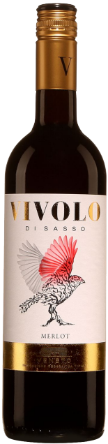
House Pour Merlot Dine in $50.00++ Take away $30.00+