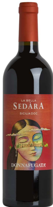
Donnafugata Sedara Dine in $90.00++ Take away $50.00+