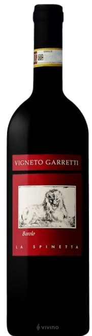
Barolo Spineta Dine in $150.00++ Take away $120.00+