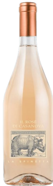
Casanova Rose Spineta Dine in $85.00++ Take away $50.00+