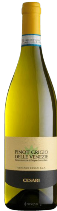
Cesari Pinot Grigio Dine in $60.00++ Take away $34.00+