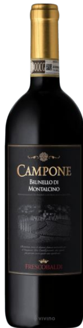
Campone Brunello Dine in $120.00++ Take away $86.00+