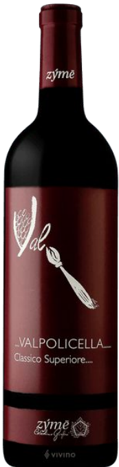
Zyme Valpolicella Classico Dine in $100.00++ Take away $73.00+