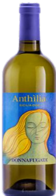
Donnafugata, Anthillia Dine in $75.00++ Take away $45.00+