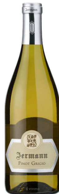
Jerman Sauvignon Blanc Dine in $90.00++ Take away $75.00+