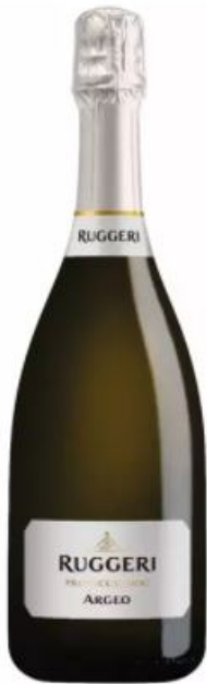
Ruggeri Prosecco Argeo Dine in $60.00++ Take away $34.00+