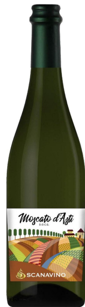
Moscato d'Asti Scanavino Dine in $60.00++ Take away $34.00+