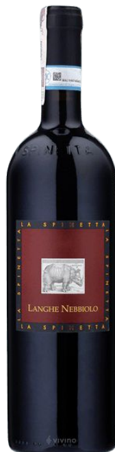
Nebbiolo Spineta Dine in $115.00++ Take away $73.00+