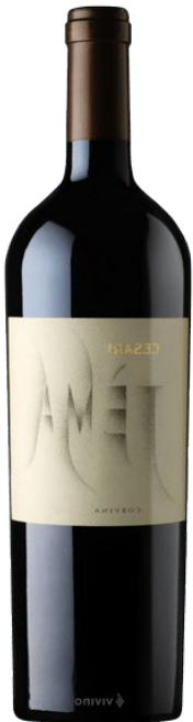
Cesari Jemma Corvina Dine in $100.00++ Take away $65.00+