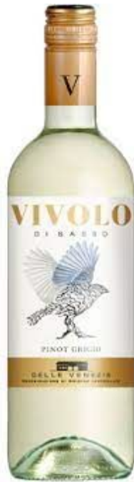
House Pour White Wine Dine in $50.00++ Take away $30.00+