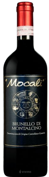
Mocali Brunello Dine in $135.00++ Take away $95.00+