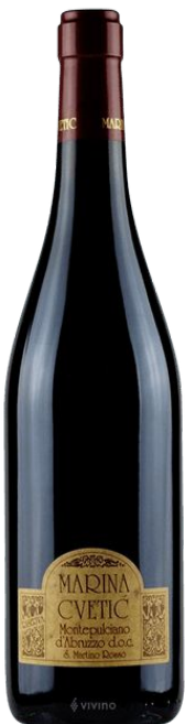
Masciarelli Montepulciano Dine in $115.00++ Take away $73.00+