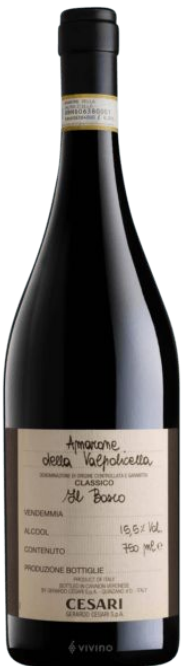
Amarone il Bosco Dine in $180.00++ Take away $125.00+