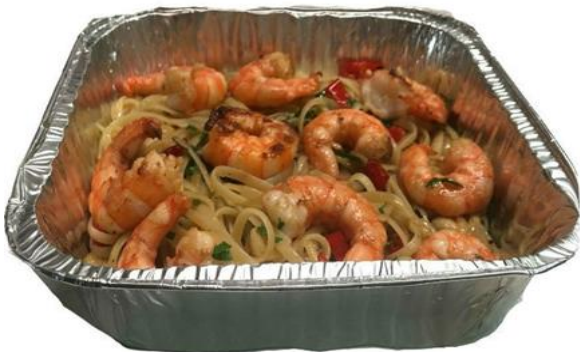
Spaghetti with Shrimps